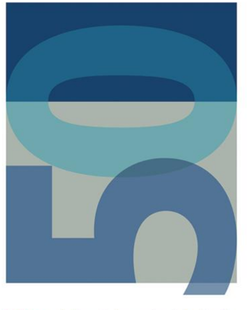
50 Years of Growth, Innovation & Leadership