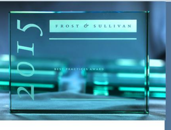
FROST & SULLIVAN